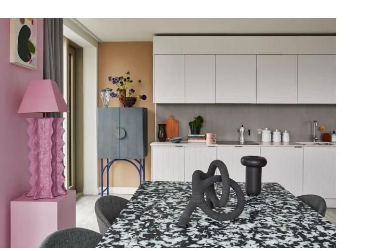
, Office and workspace